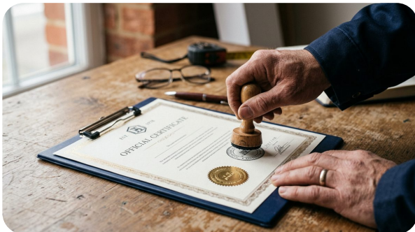
Documentation your client — and you — can rely on.

Prefer your clients to see a familiar name? We can co-brand the referral so the handover feels seamless — your relationship, our repair. Ask us about a co-branded partnership.